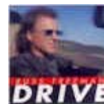
Russ Freeman Drive